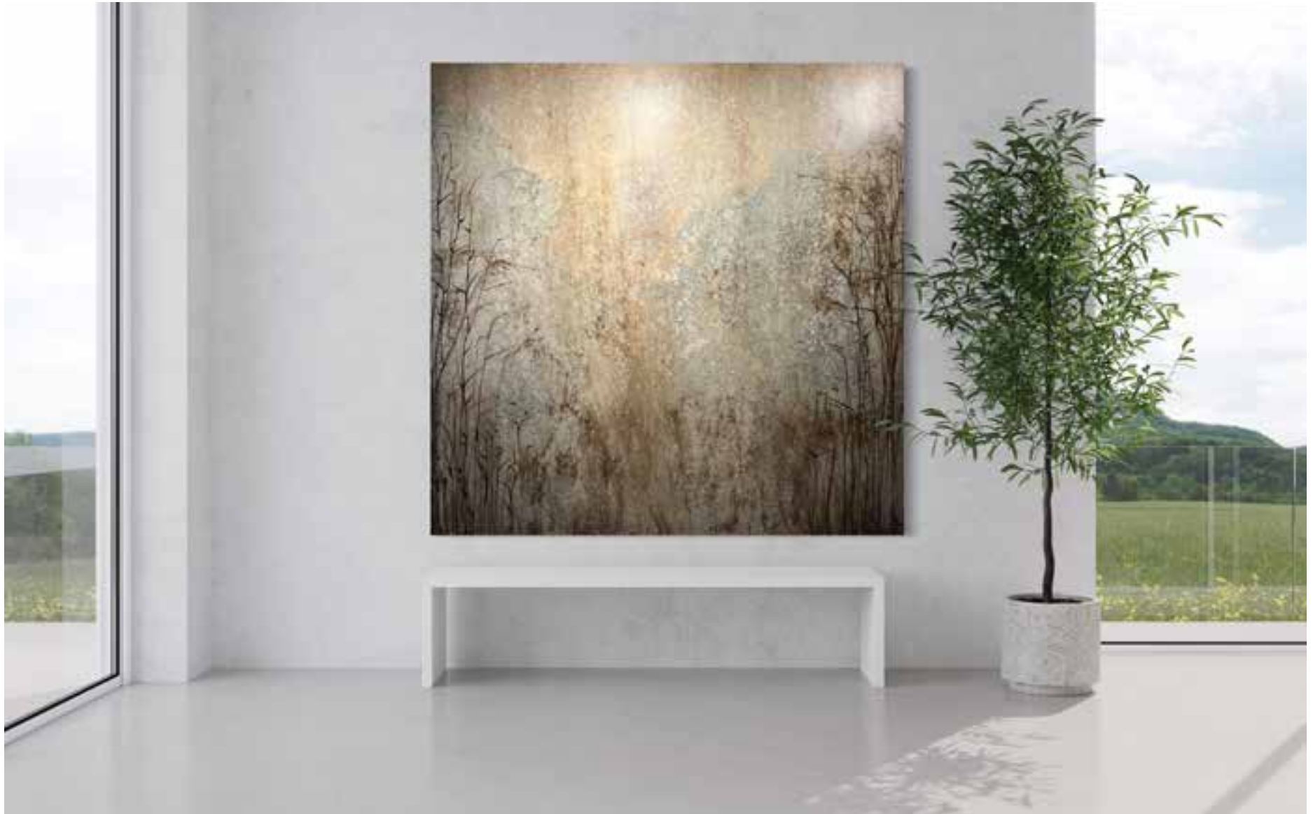
THE MOORS OIL ON CANVAS / 200 X 200 CM ENQUIRE ABOUT THIS ARTWORK