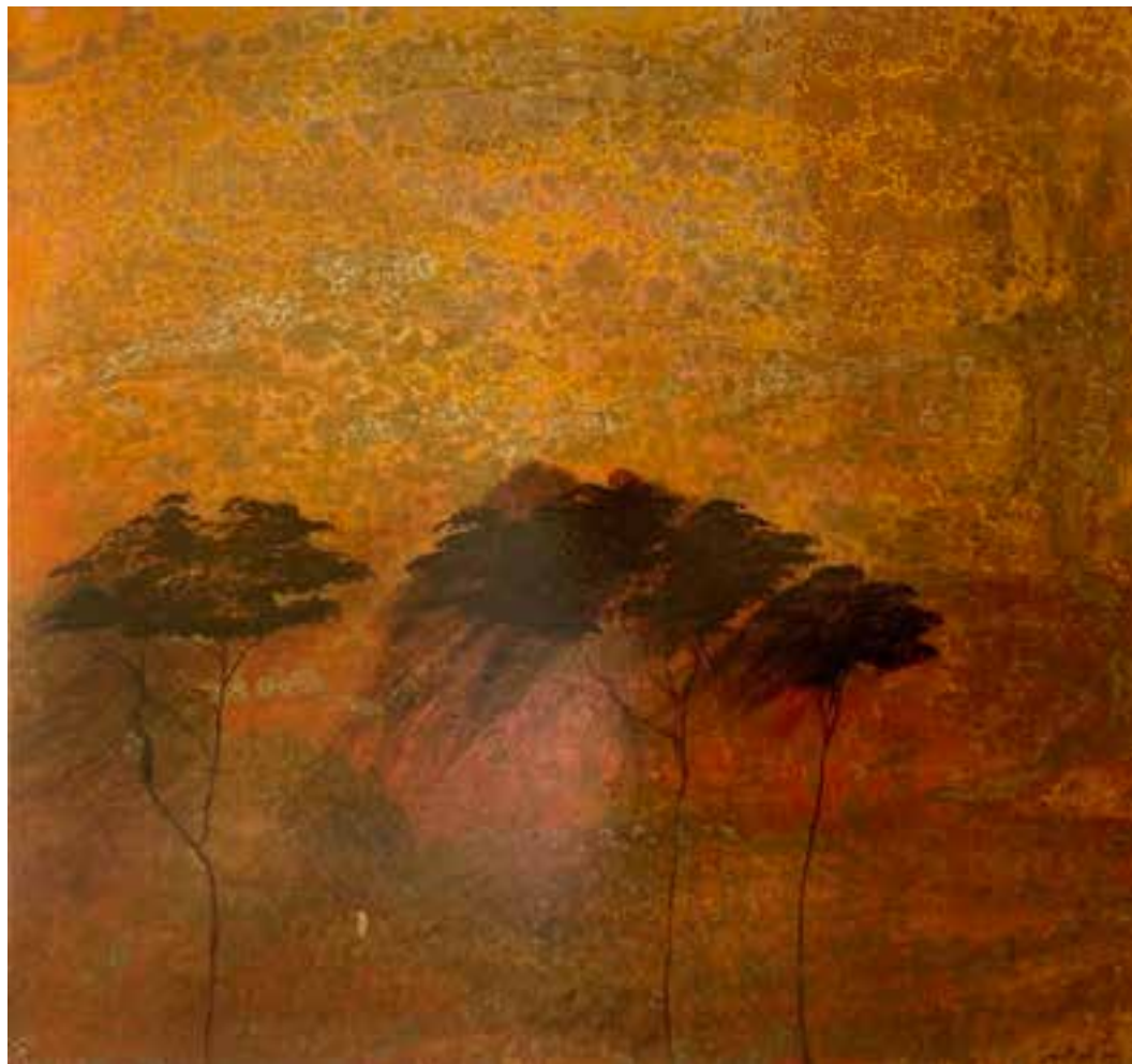
VIEW FROM KOONYUM RANGE ● OIL ON CANVAS / 140 X 130 CM / 2021 PADDINGTON ART PRIZE FINALIST