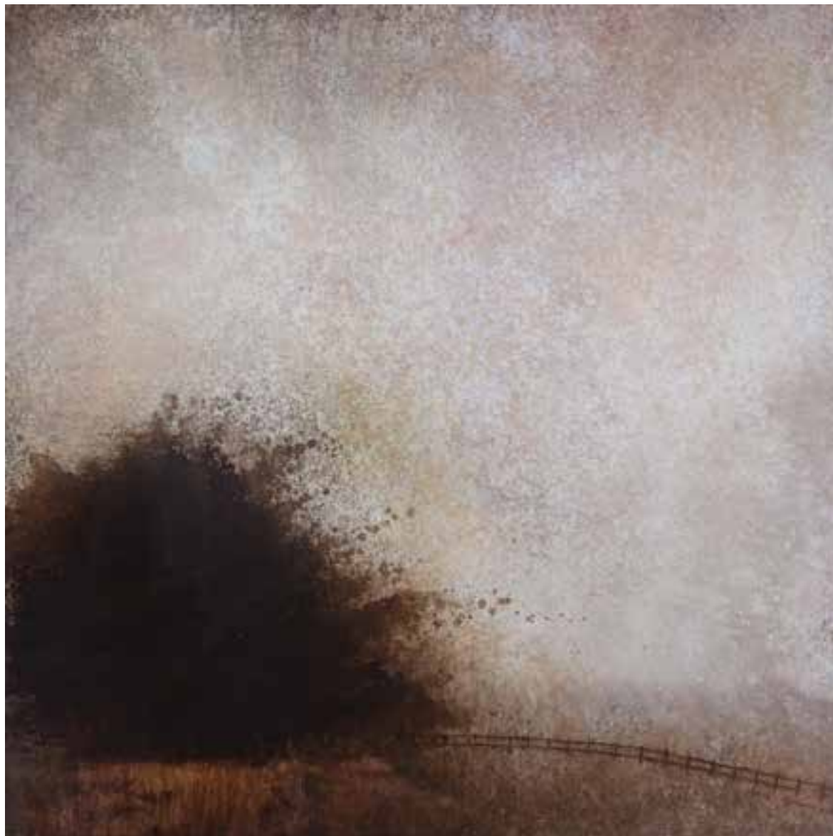
BAMBOO LOOMING OIL ON CANVAS / 200 X 200 CM