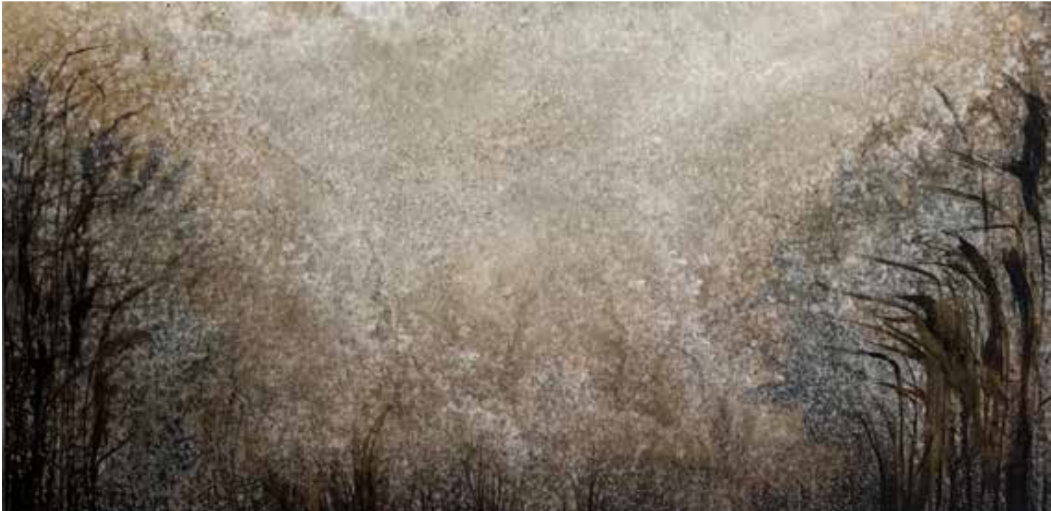
LOW GRASS OIL ON CANVAS / 200 X 100 CM