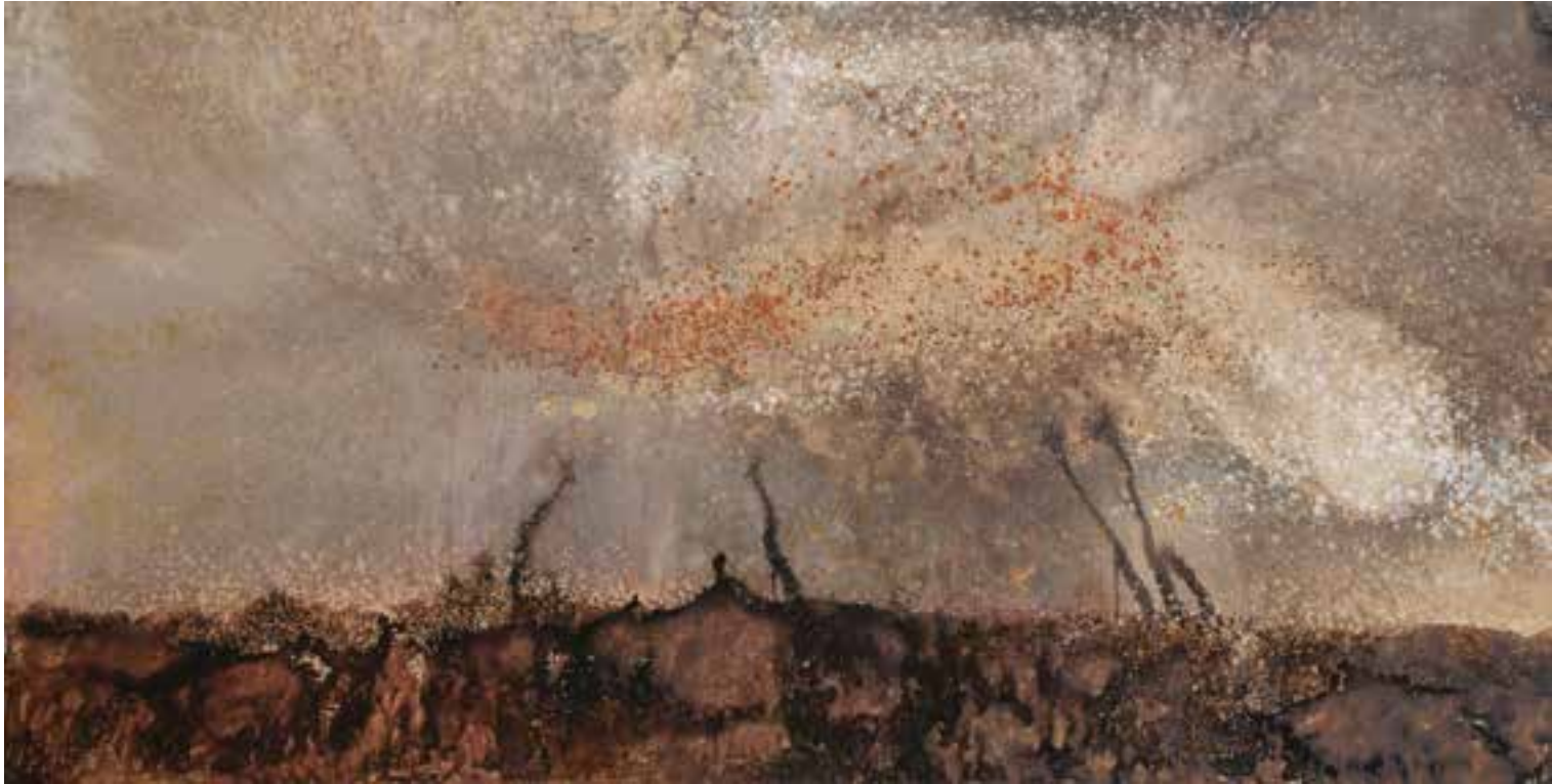
DAWN CONSTELLATIONS OIL ON CANVAS / 200 X 100 CM