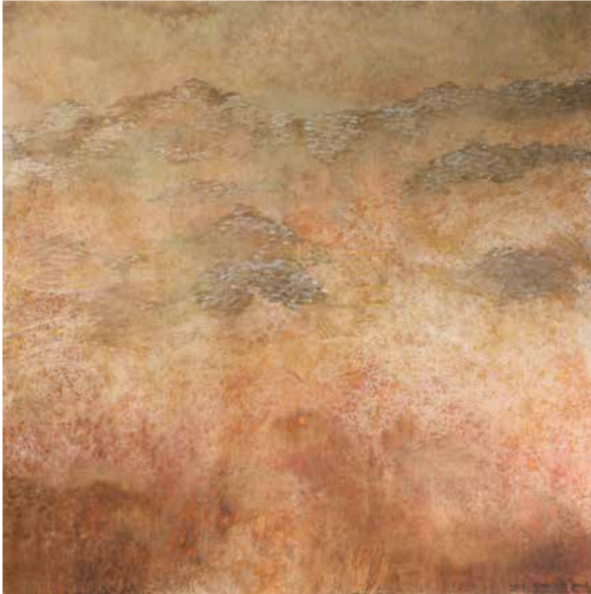
ELEGY OIL ON CANVAS / 200 X 200 CM