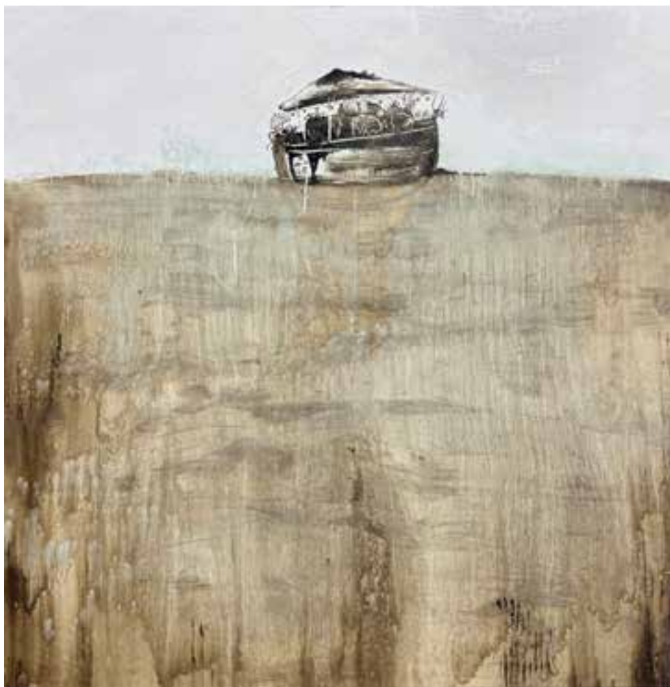
NOAH'S ARK #1 (STUDY) ● OIL AND ACRYLIC ON CANVAS / 150 X 150 CM