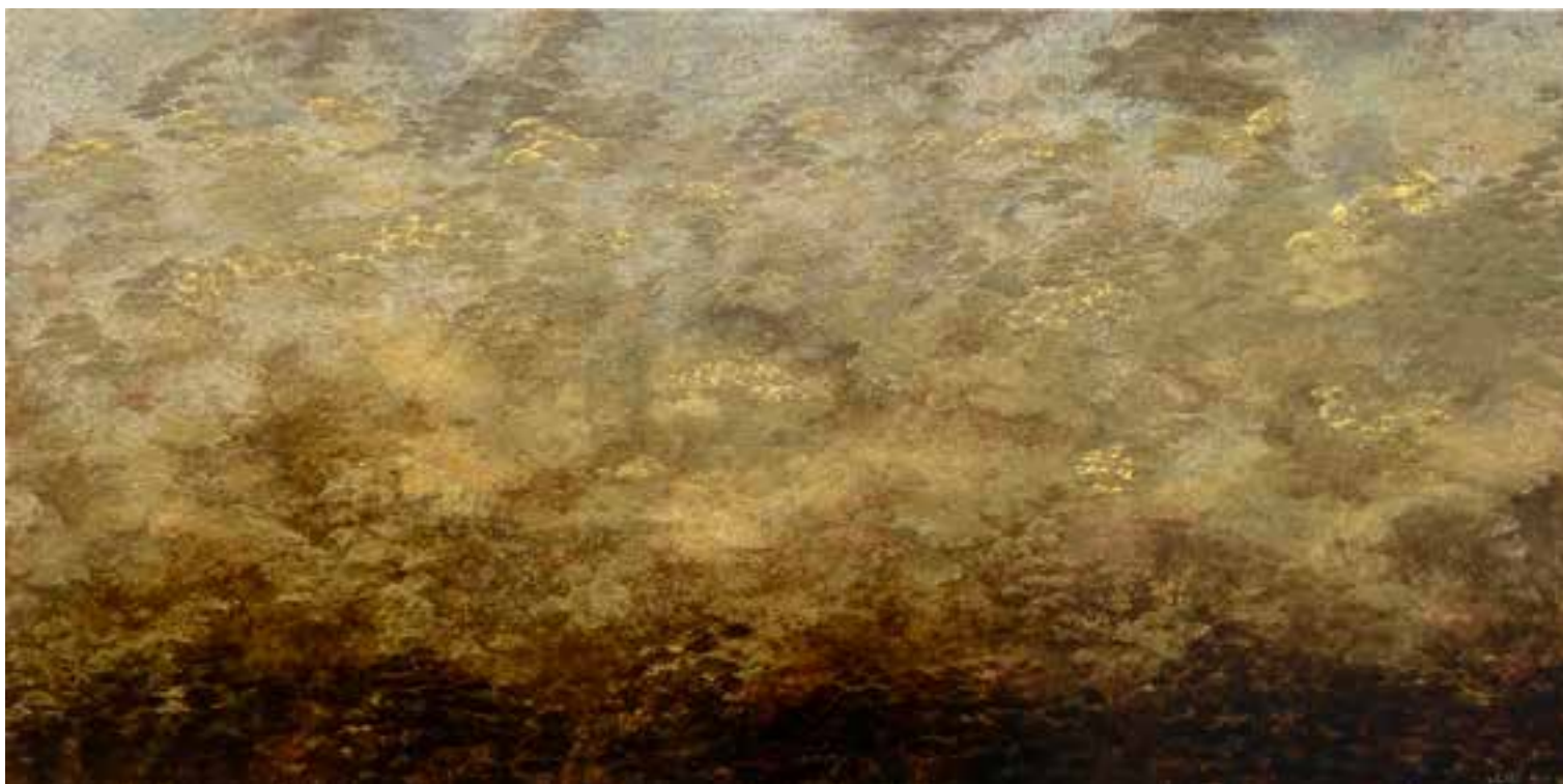
ESCARPMENT IN GOLD ● OIL AND 24 CARAT GOLD LEAF ON CANVAS 200 X 100 CM