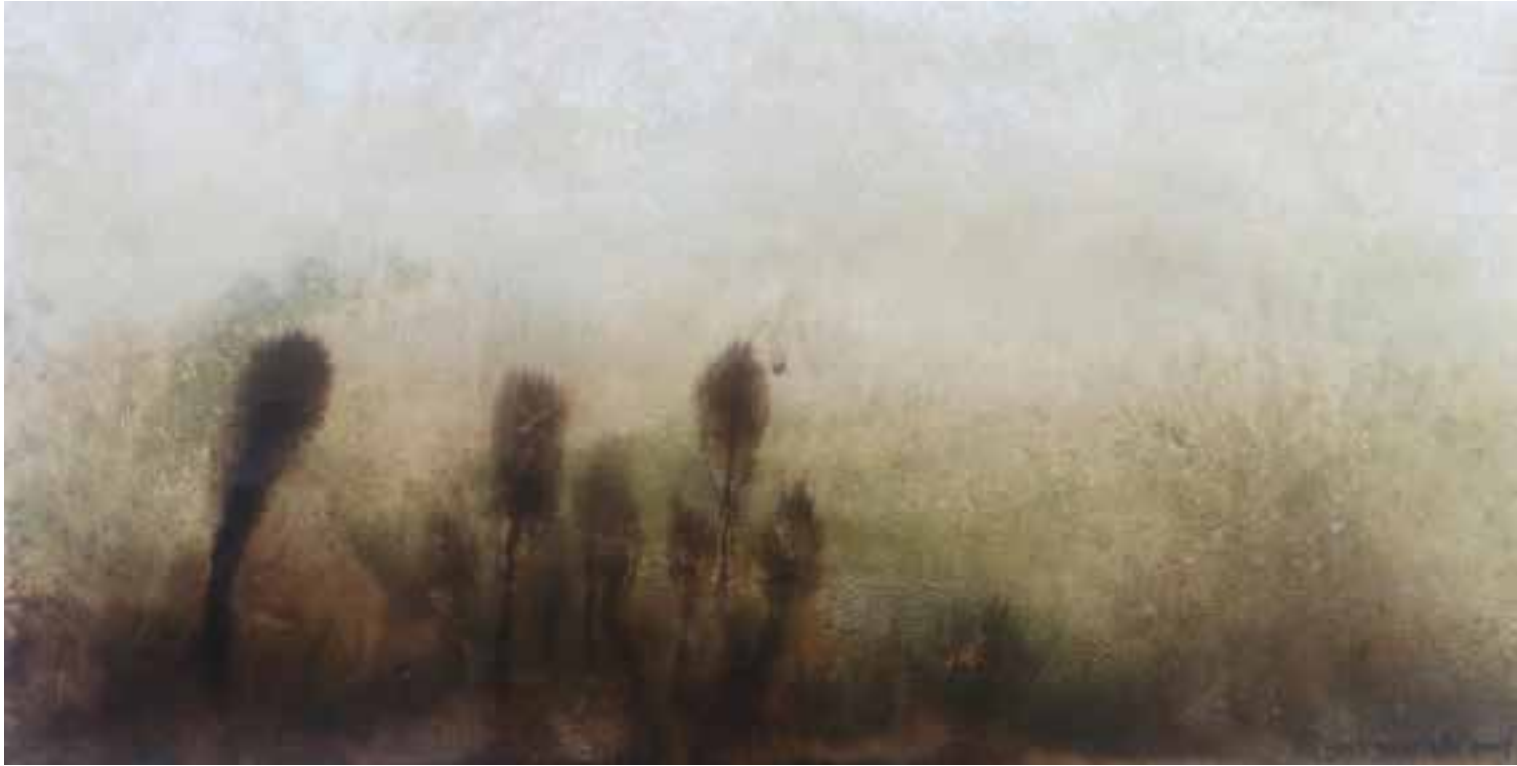
ANT EYE VIEW OIL ON CANVAS / 200 X 100 CM