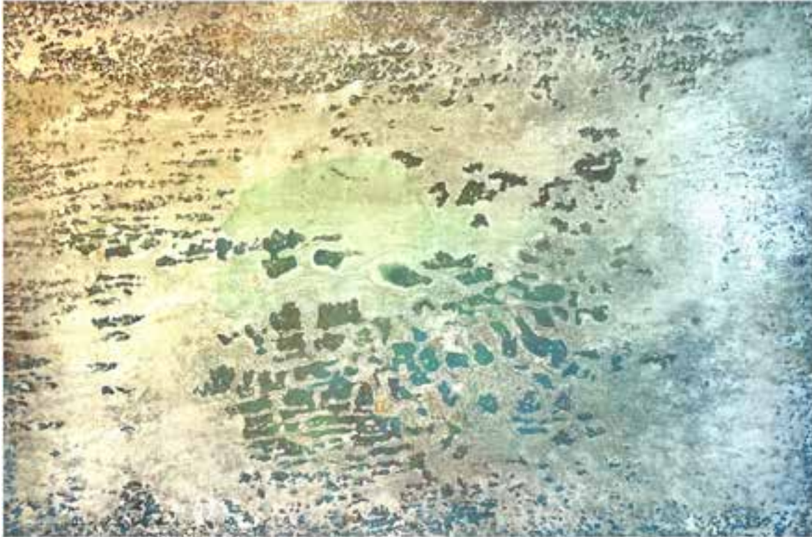
MESOSPHERE OIL ON CANVAS / 150 X 100 CM