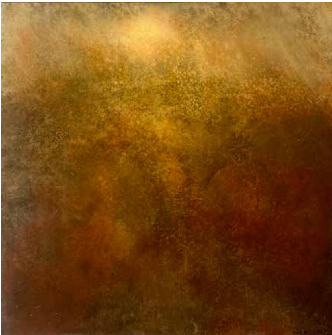
ALGAE BLOOM OIL ON CANVAS / 200 X 200 CM