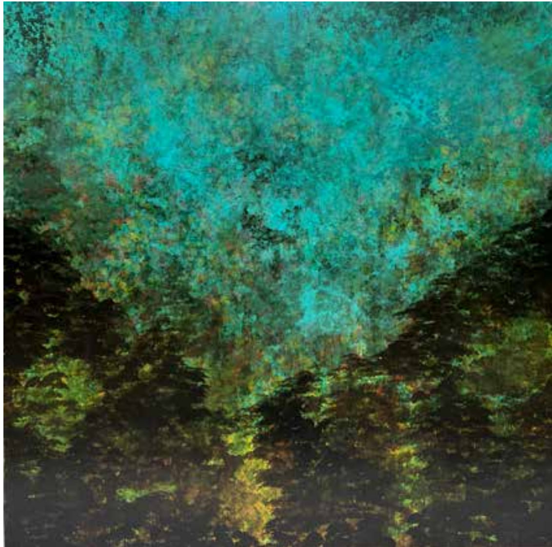
CABIN IN THE WOODS OIL ON CANVAS / 150 X 150 CM ENQUIRE ABOUT THIS ARTWORK