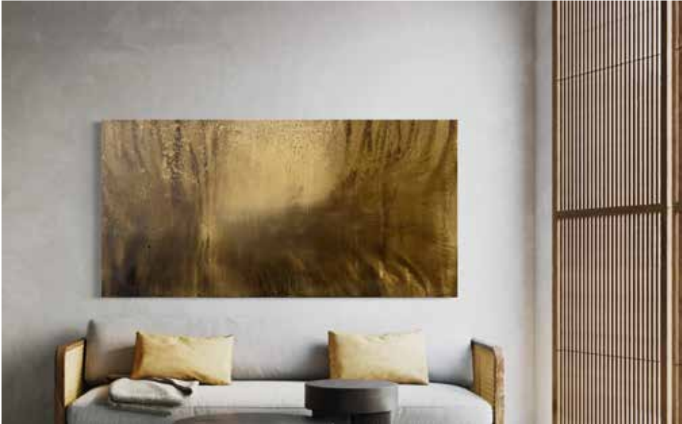
IMMORTAL MEMORY OIL ON CANVAS / 200 X 100 CM