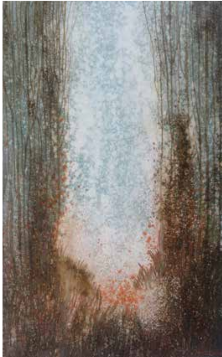
THE INVITATION OIL ON CANVAS / 120 X 180 CM