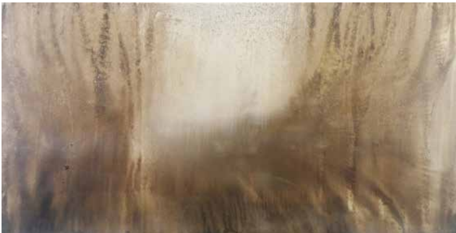
IMMORTAL MEMORY OIL ON CANVAS / 200 X 100 CM