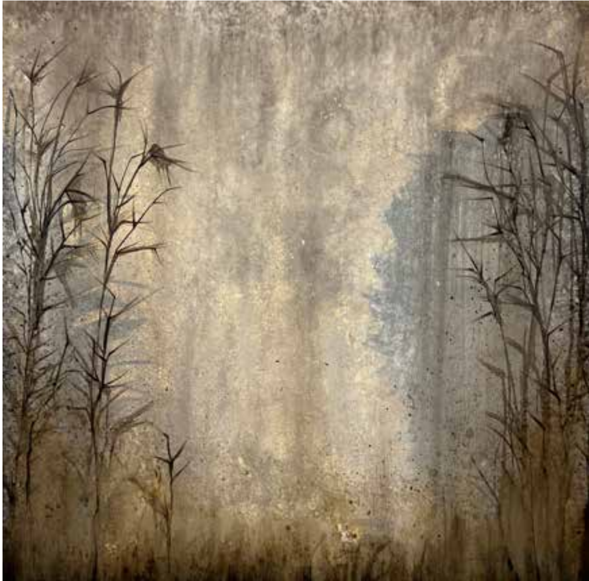
NASHUA MIST OIL ON CANVAS / 200 X 200 CM