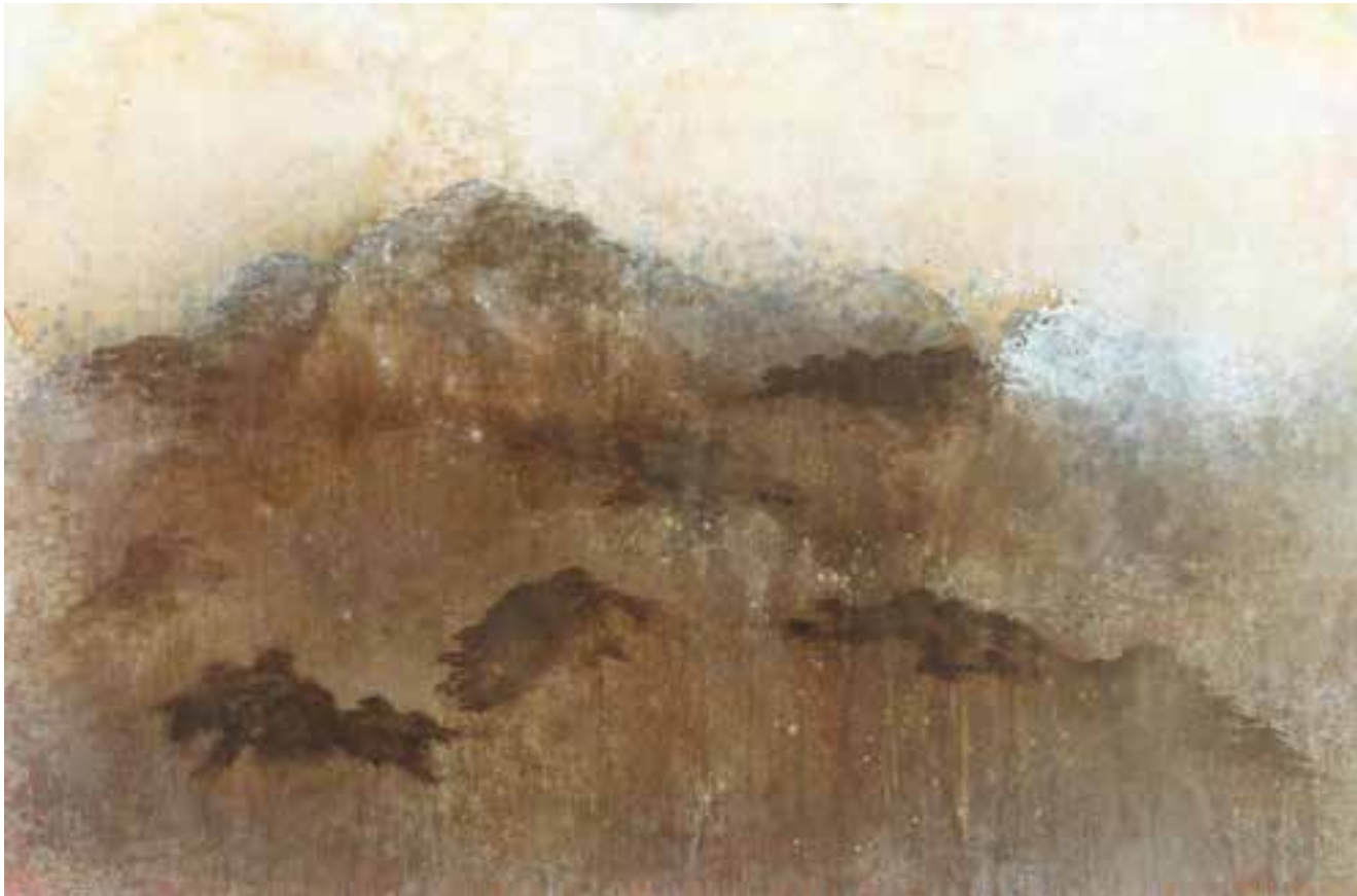
FALLEN EMBER OIL ON CANVAS / 150 X 100 CM ENQUIRE ABOUT THIS ARTWORK