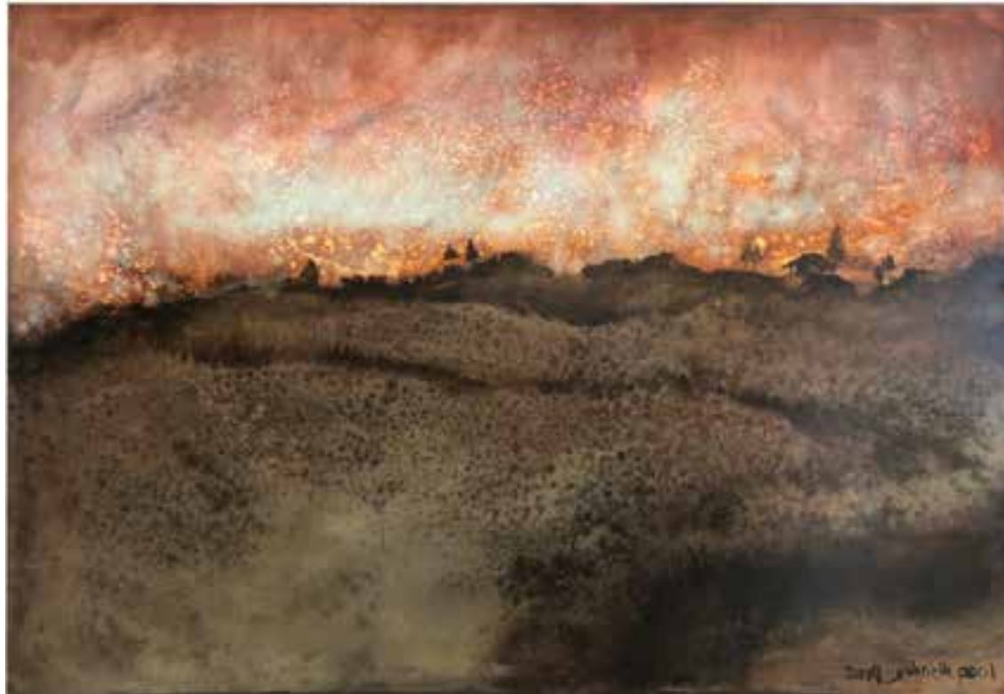
DRIVING HOME OIL ON CANVAS / 150 X 100 CM