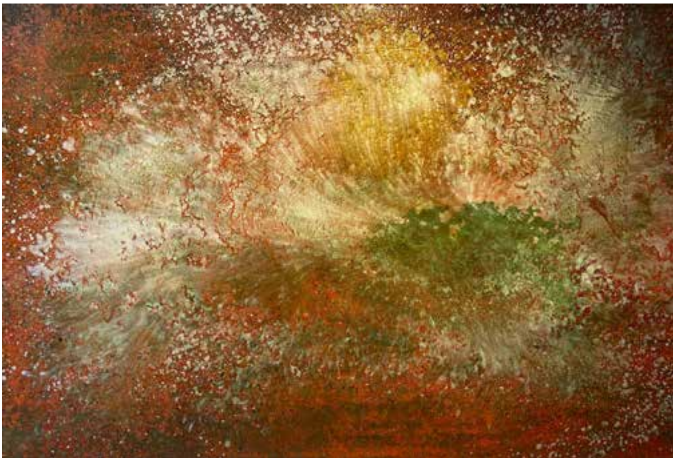
THE UNKNOWN OIL ON CANVAS / 180 X 120 CM