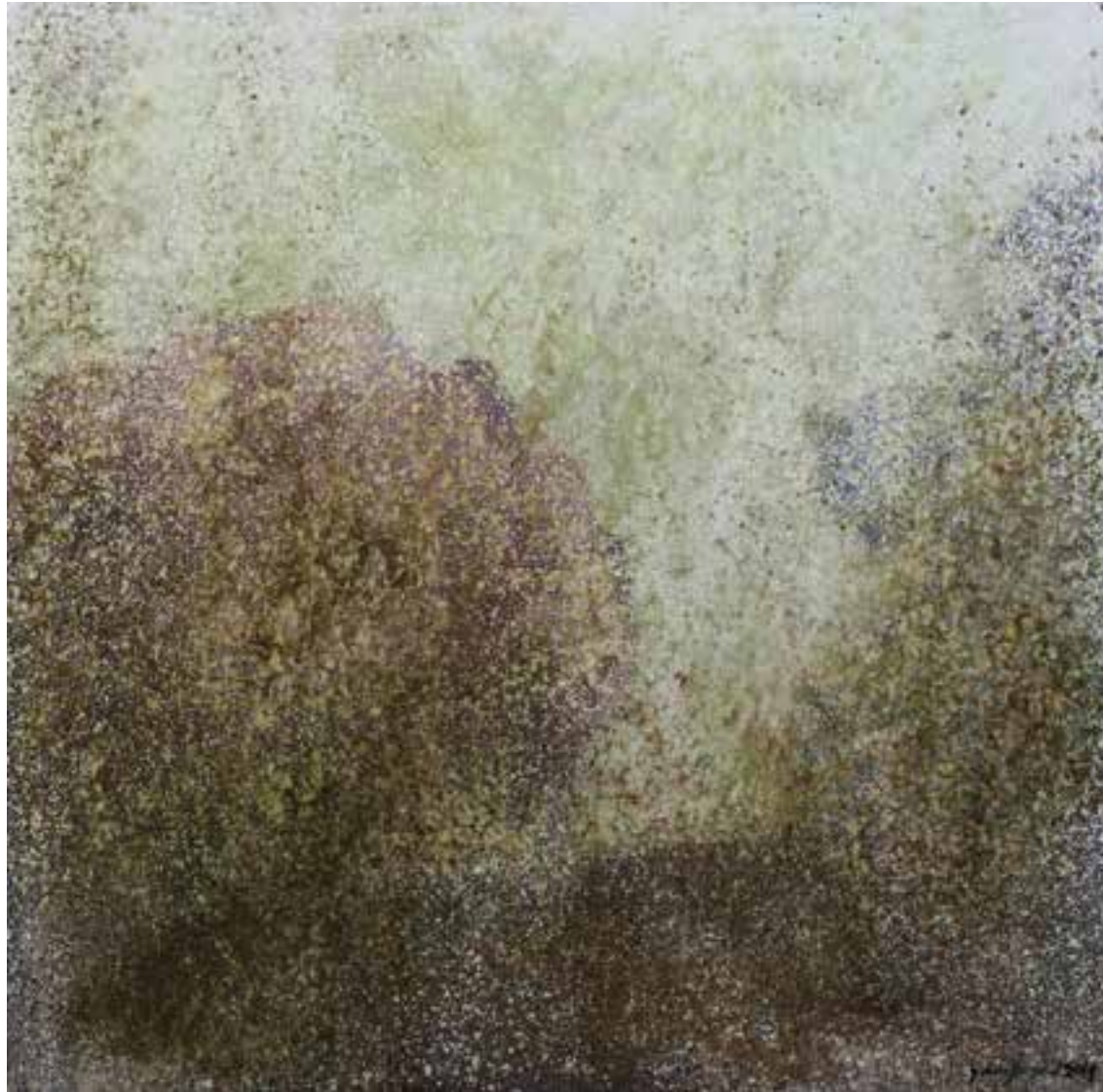
ELDERFLOWER FOREST ● OIL ON CANVAS / 150 X 150 CM / GABRIELLE POOL