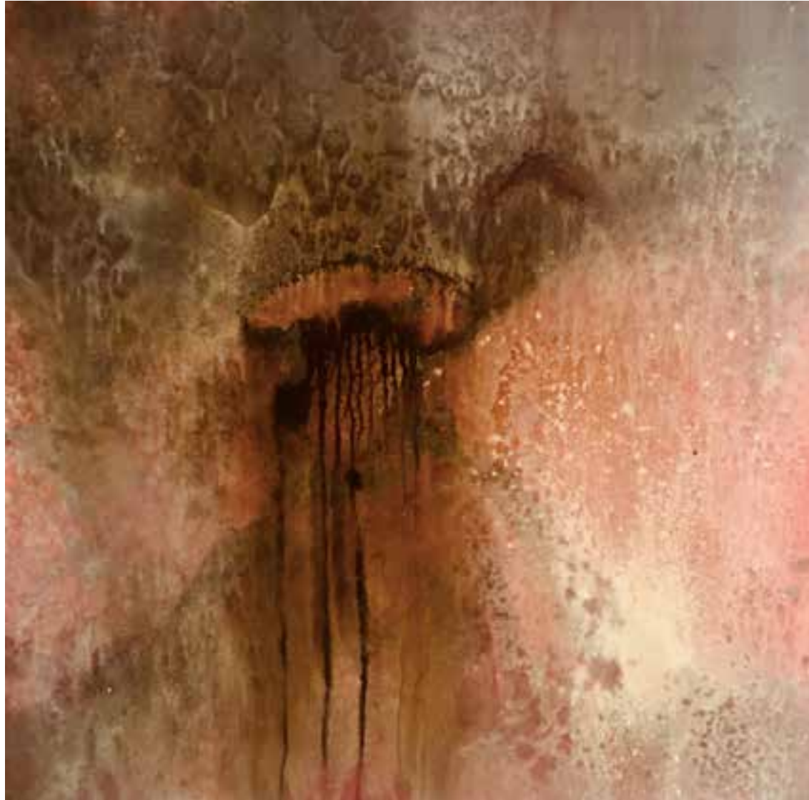
DARK EMU OIL ON CANVAS / 150 X 150 CM