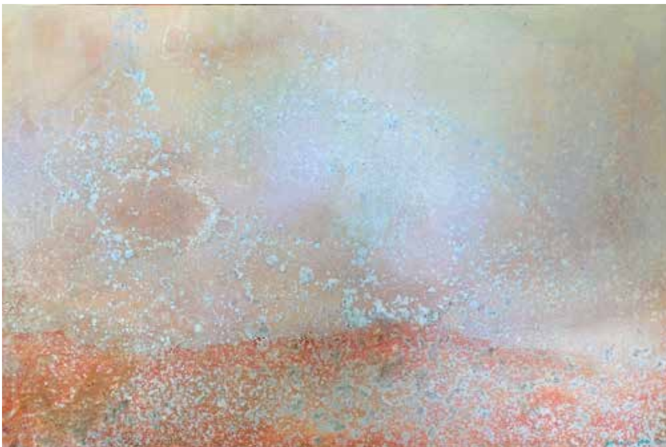
SEAMIST 2 OIL ON CANVAS / 150 X 100 CM