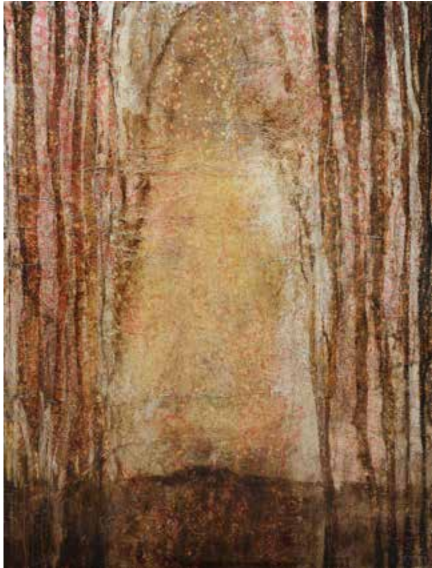
ENCHANTED FOREST 1 OIL ON CANVAS / 150 X 200 CM