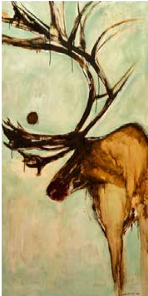
REVENGE OF THE REINDEER 1 OIL ON CANVAS / 100 X 200 CM