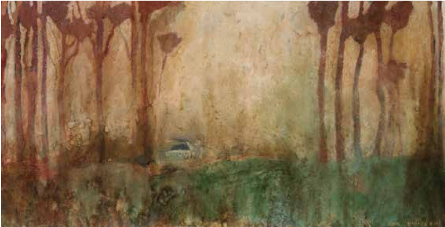
HOUSE IN WOODS - AUTUMN