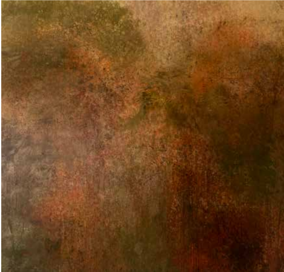
ENORMITY OF NOTHING OIL ON CANVAS / 200 X 200 CM