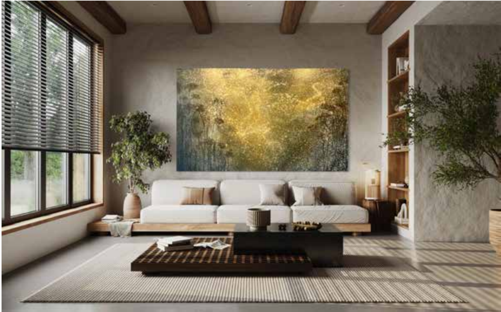
TRAVELLING LIGHTS OIL ON CANVAS / 250 X 150 CM