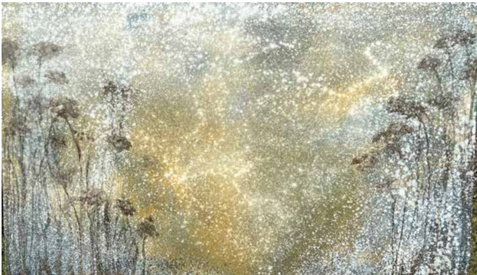
TRAVELLING LIGHTS OIL ON CANVAS / 250 X 150 CM