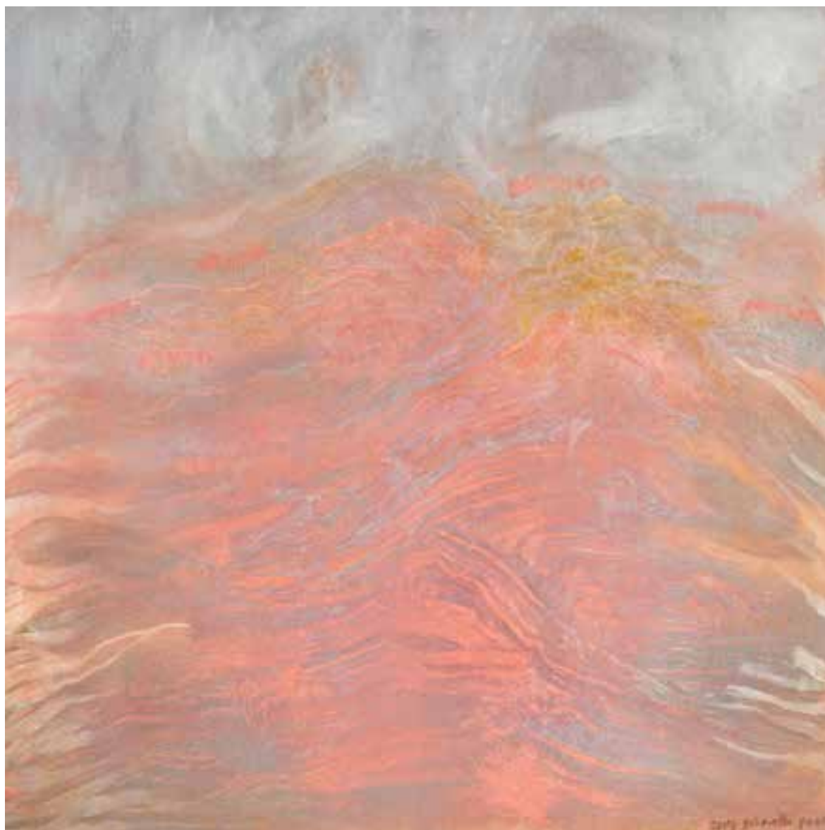
PETRICHOR OIL ON CANVAS / 200 X 200 CM