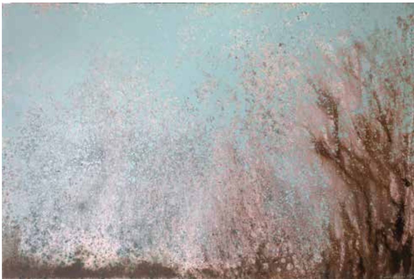
SEAMIST 1 OIL ON CANVAS / 150 X 100 CM