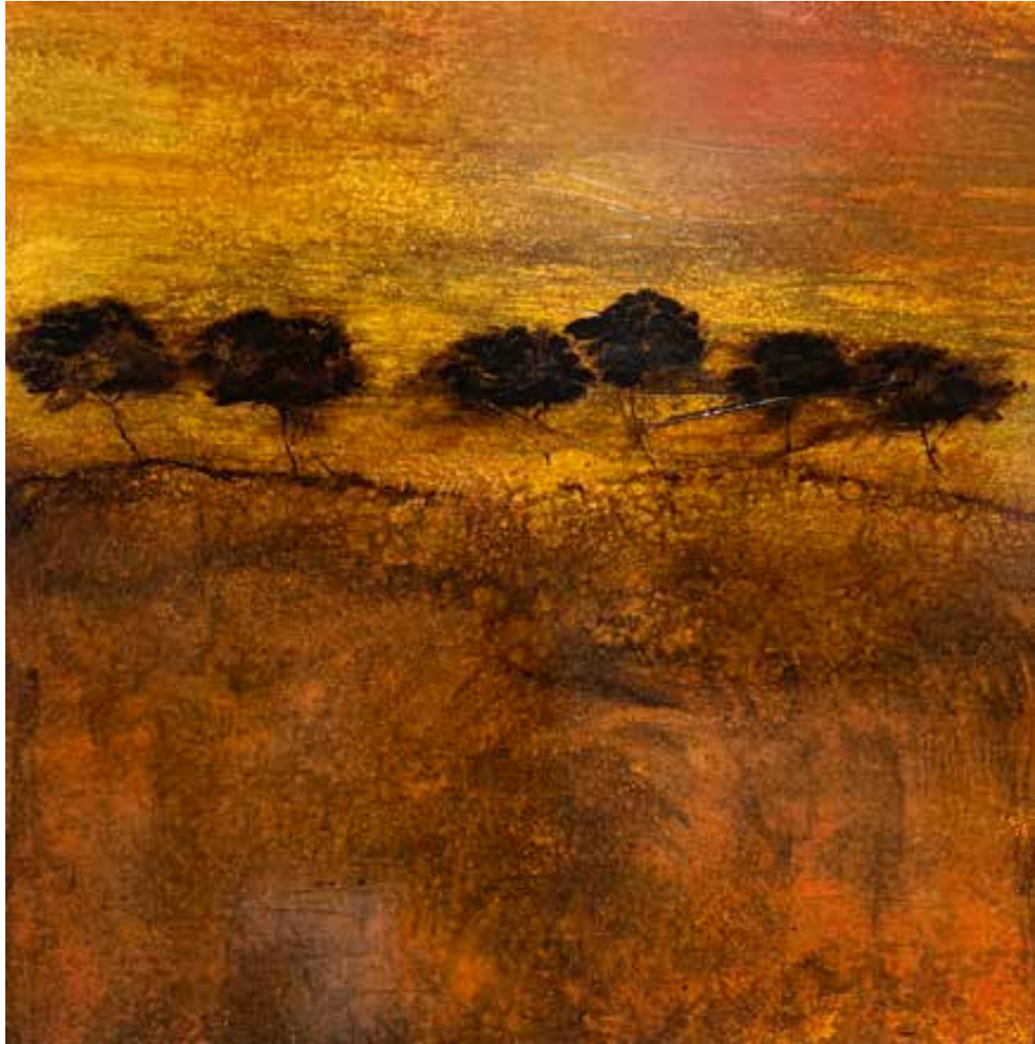
AMBOSELI OIL ON CANVAS / 200 X 200 CM