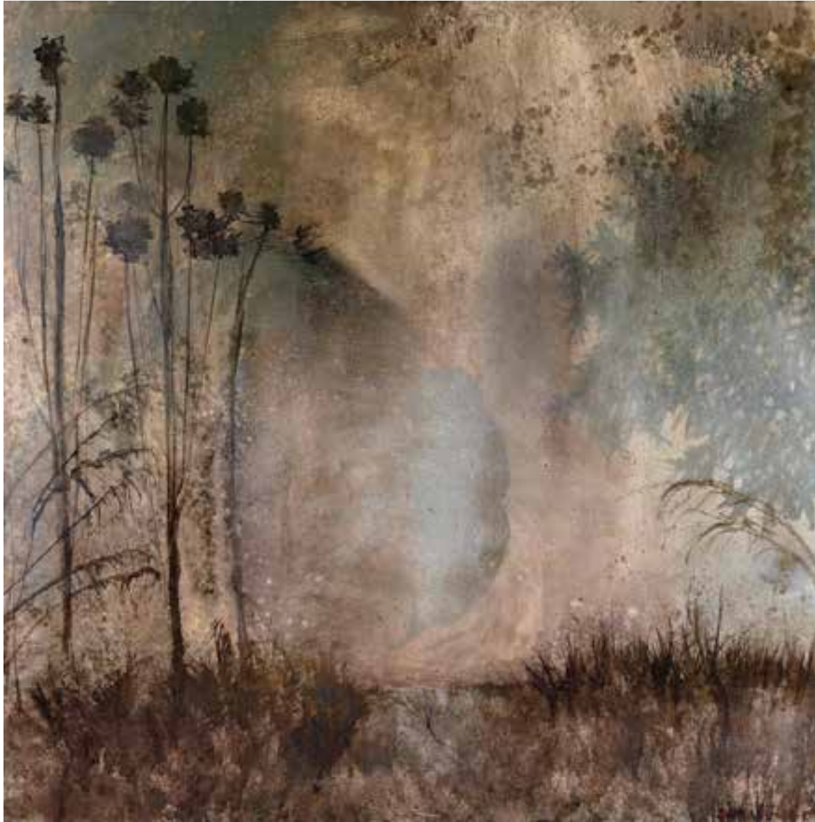
GHOST OF BULLRUSH OIL ON CANVAS / 200 X 200 CM