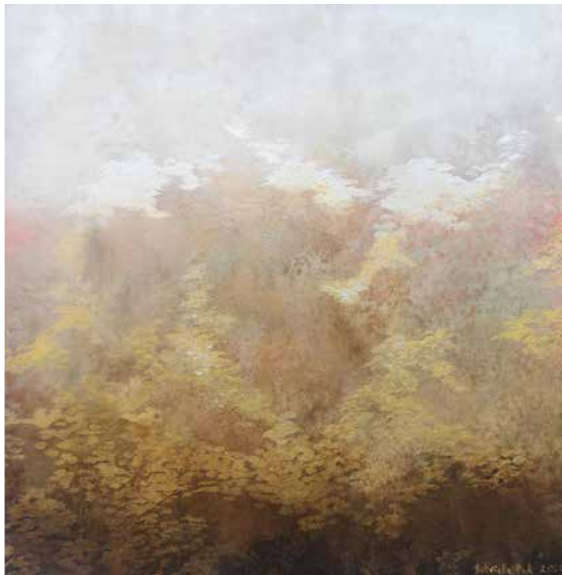
LUMINESCENCE OIL ON CANVAS / 150 X 150 CM