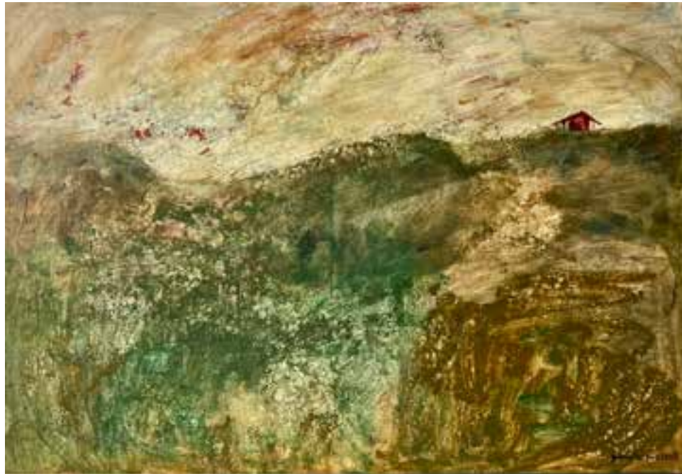
LITTLE RED HOUSE OIL ON CANVAS / 91 X 67 CM