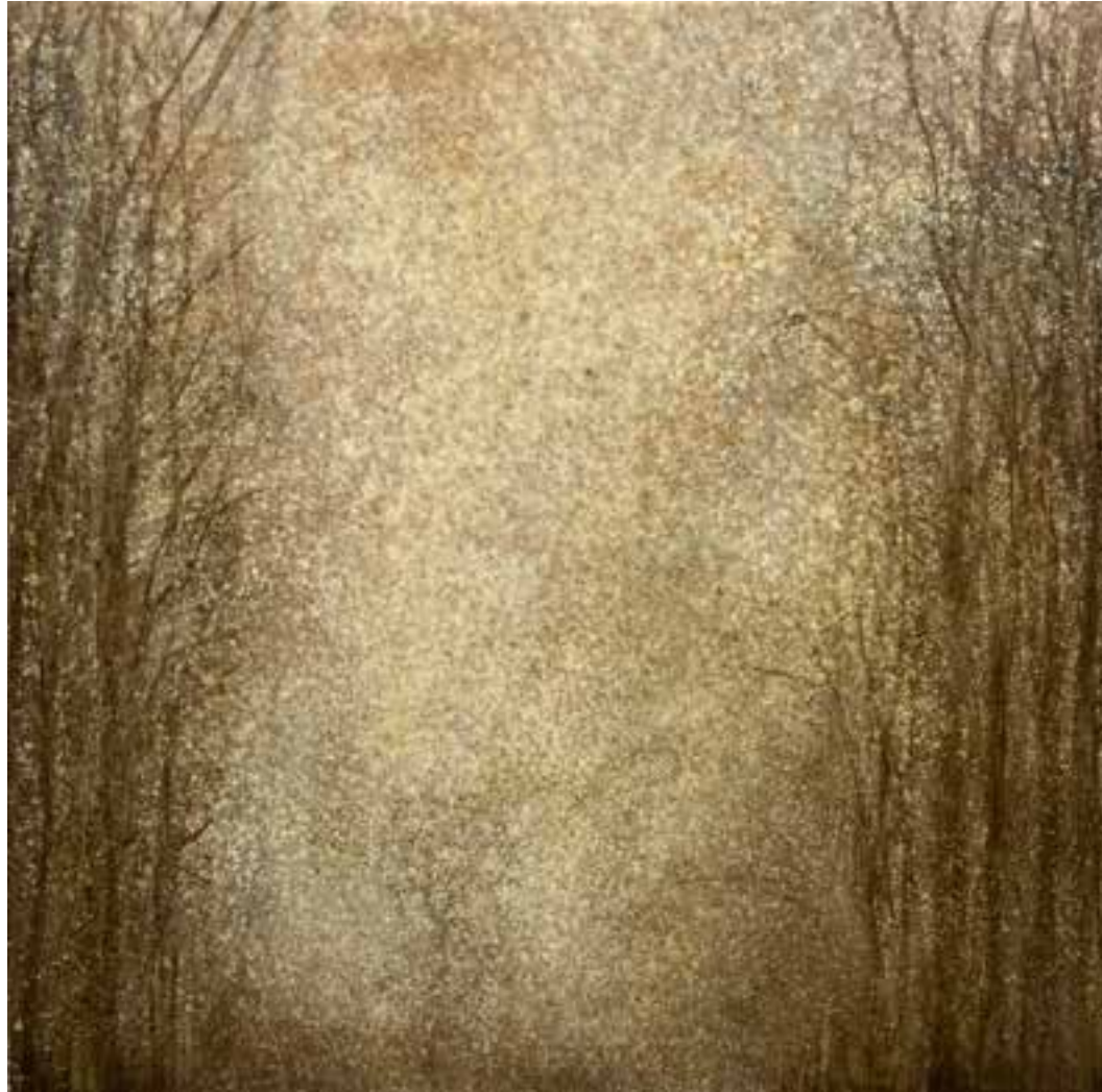
IN THE THICKET OIL ON CANVAS / 140 X 140 CM