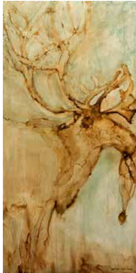
REVENGE OF THE REINDEER 2 OIL ON CANVAS / 100 X 200 CM