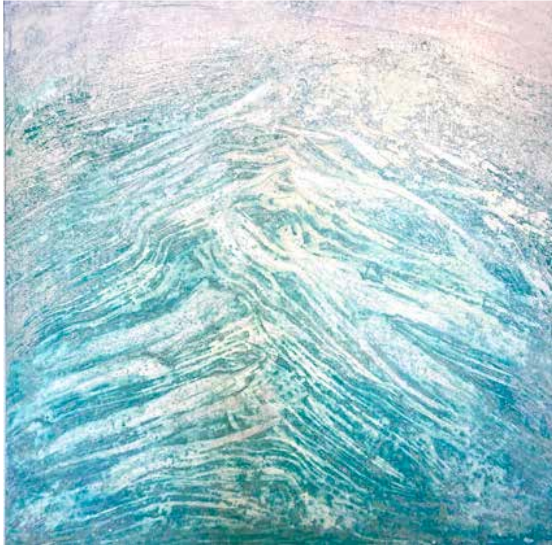
OCEAN COUNTRY OIL ACRYLIC ON CANVAS / 175 X 175 CM