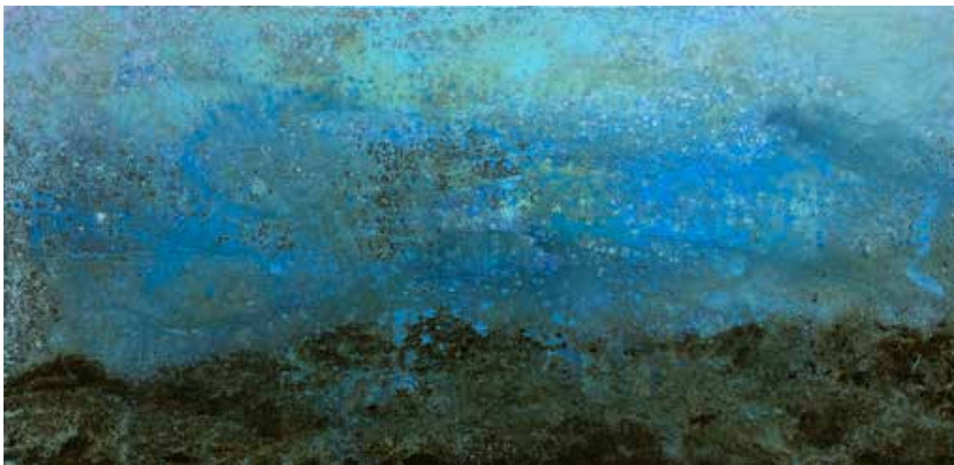
SEA STORM (STUDY) OIL ON CANVAS / 186 X 91 CM