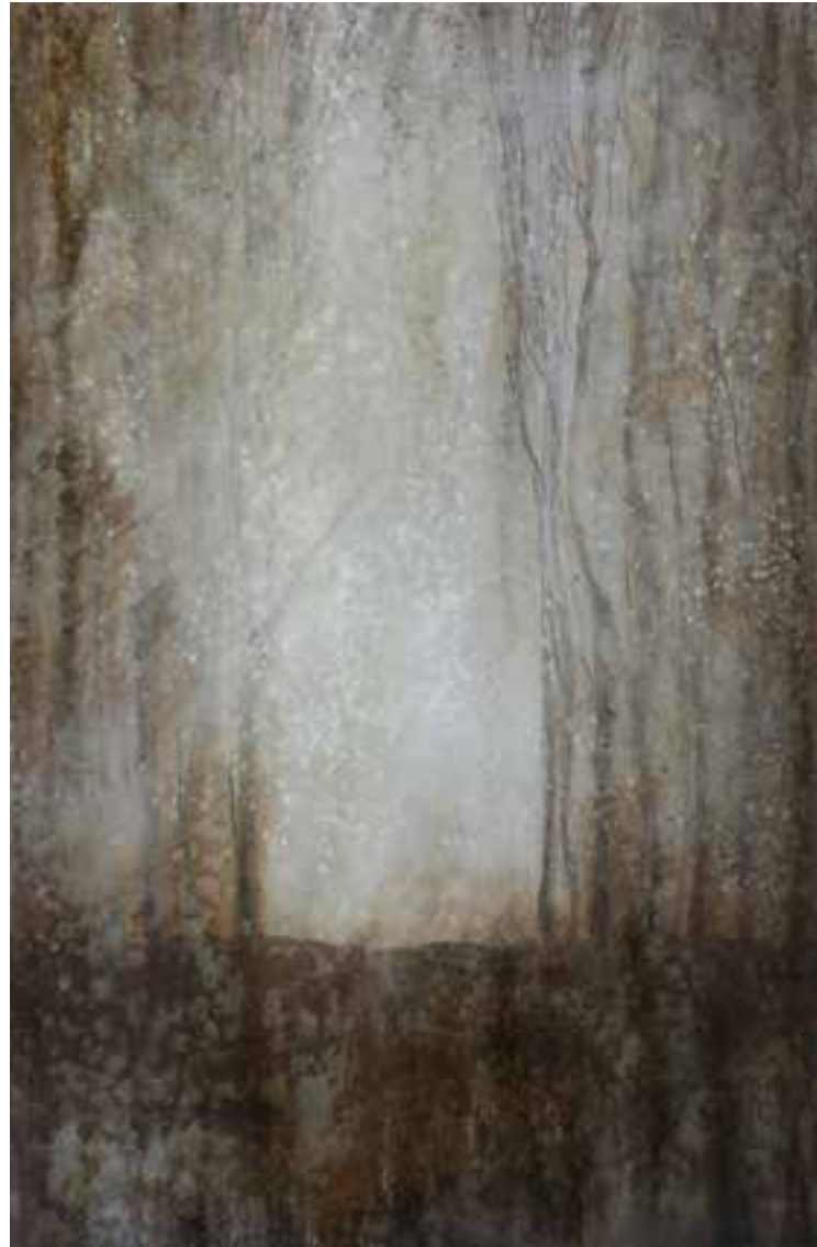
THE CORRIDOR OIL ON CANVAS / 120 X 180 CM