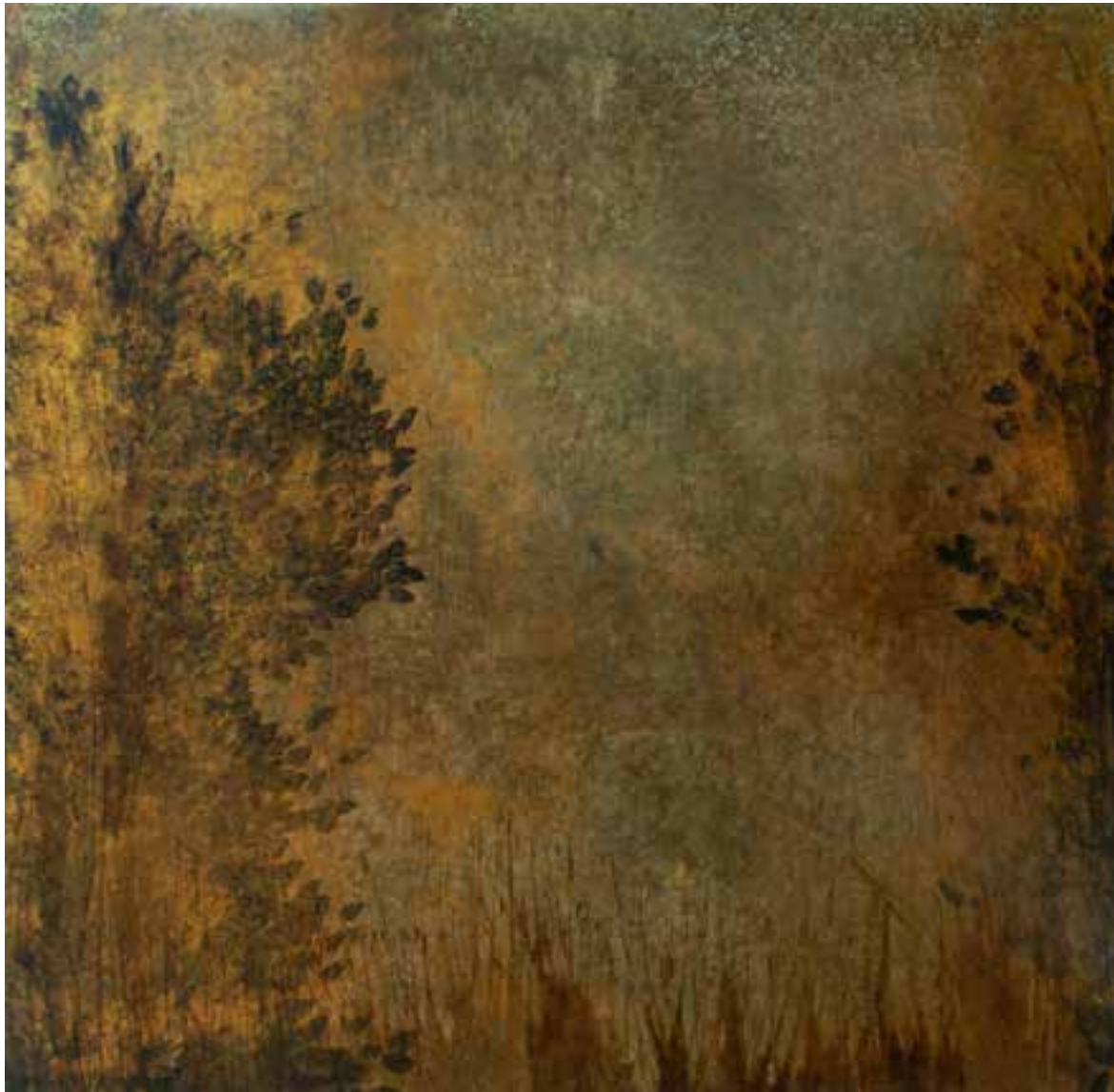
OLDE WOODS OIL ON CANVAS / 200 X 200 CM