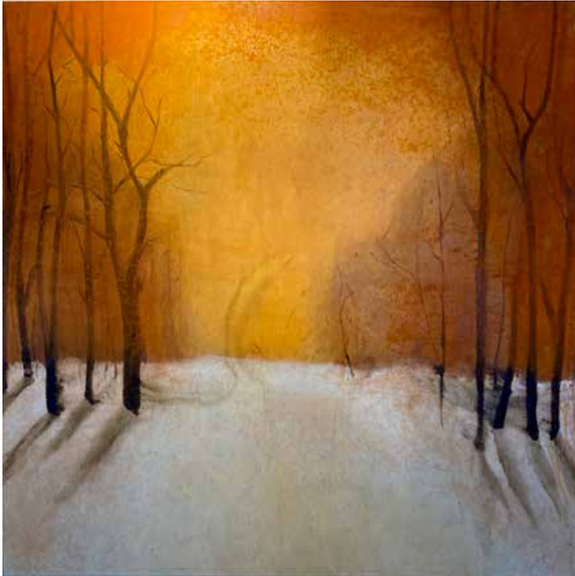
WINTER IN NARNIA OIL ON CANVAS / 200 X 200 CM ENQUIRE ABOUT THIS ARTWORK