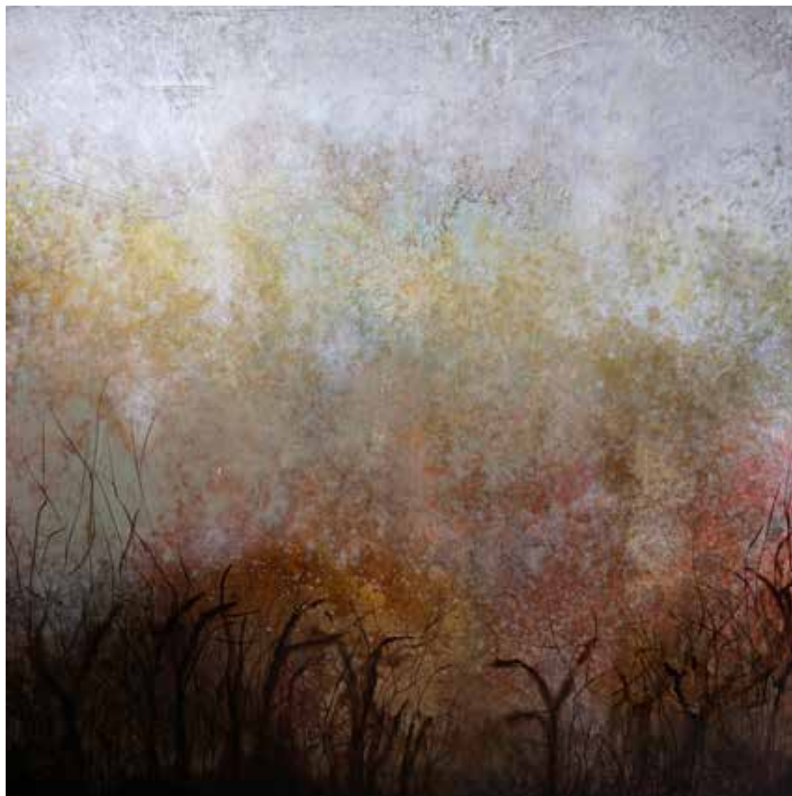
RABBITS' VIEW OIL ON CANVAS / 150 X 150 CM