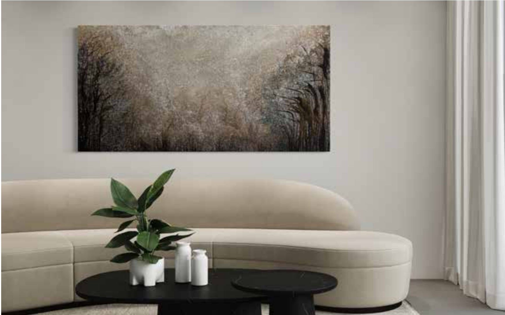
LOW GRASS OIL ON CANVAS / 200 X 100 CM